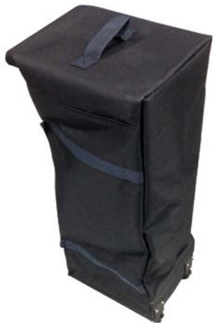
Included Transportation bag