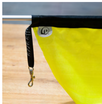
5. Infila la vela Insert the flag