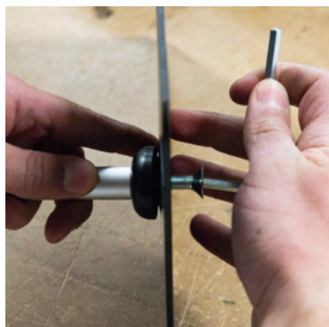
4. Avvita la base Screw the base