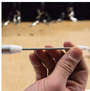
2. Tira Pull