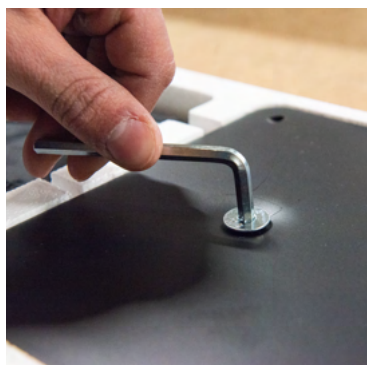
1. Gira Turn