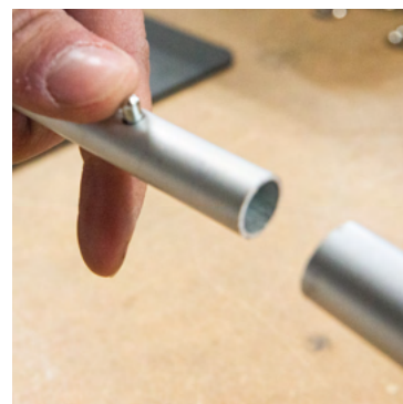
3. Premi e incastra il bottone Push and stuck the button