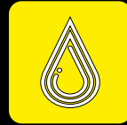
Water repellent material