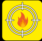
Fireproof material available